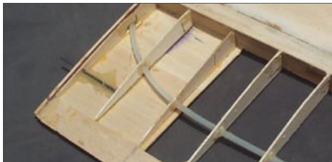
This photo shows the routing of the guide tubes through the wing.

epoxied in place. Just be sure that the wing and fuselage guide tubes are aligned when the wings are installed.