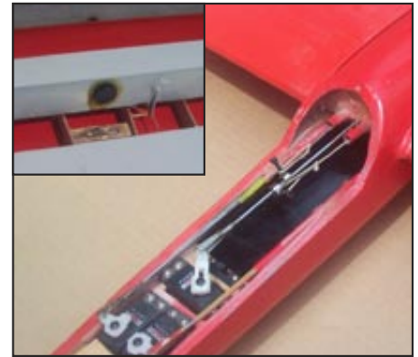
A short section of pushrod is installed between the spoiler servo and a guide at the rear of the servo.

rod, and then tightening the screws to lock the collars in place.